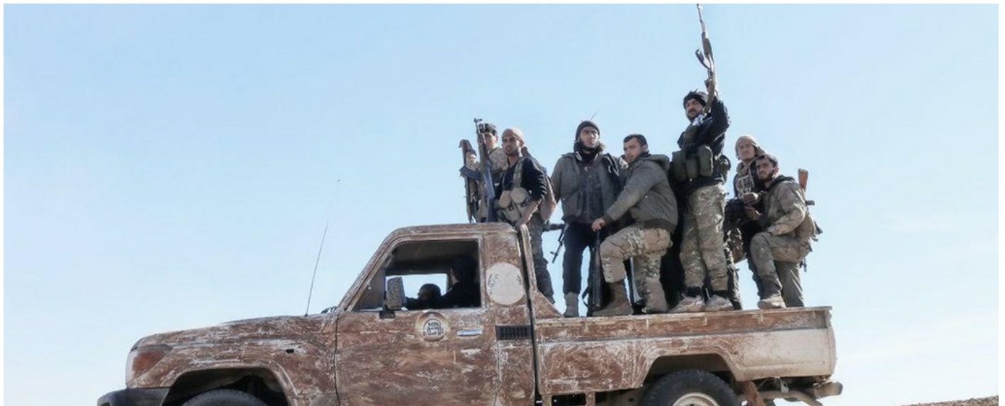
EUPHRATES SHIELD REBELS ON THE MOVE.

East Aleppo, and Euphrates Shield specifically, is a sort of hybrid of Syria's eastern and western wars. Turkey has recruited opposition rebels to man Euphrates Shield, including rebels transported through Turkish territory from Idlib to north Aleppo. But those rebels have been deployed, to a large extent, in service of Turkish security objectives unrelated to the fight against the Assad regime.