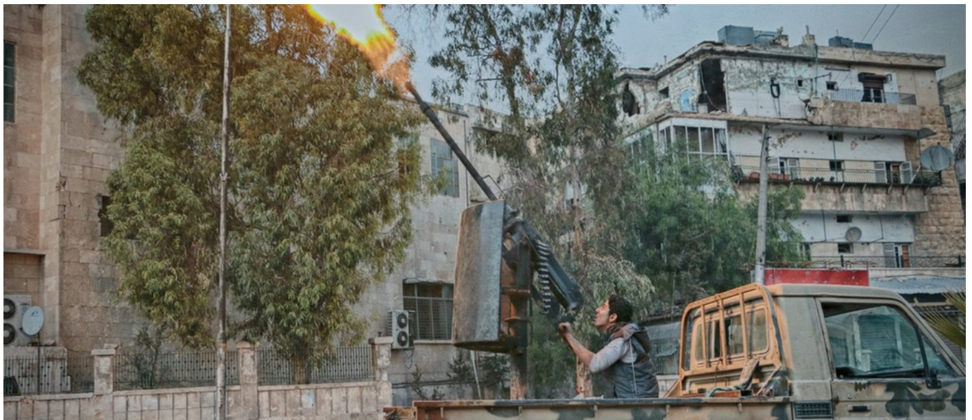
REBEL INSIDE ALEPPO CITY FIRES AT PLANES OVERHEAD.

In the north, Aleppo province had been considered the northern stronghold of Syria's more mainstream opposition. 13 But the regime's Russian-backed offensive in February 2016 cut the rebel-held Aleppo countryside in half 14 and, in July of this year, the regime finally managed to besiege Aleppo city's rebel-held eastern neighborhoods. Despite repeated attempts by rebels to break the blockade, the regime seems poised to eventually retake the entirety of Aleppo city. 15