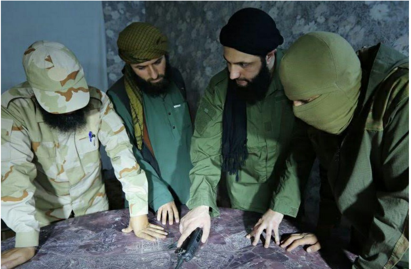
FATEH AL-SHAM FRONT HEAD ABU MUHAMMAD AL-JOLANI MEETS WITH COMMANDERS TO DISCUSS BATTLE FOR ALEPPO.

Despite simmering tensions between more mainline rebels and Salafi-jihadist factions led by Fateh al-Sham, any real confrontation would fatally weaken the opposition's fight against the regime and is seen as impossible. In January 2014, open war erupted between rebels and Islamic State across the Syrian north. Islamic State was driven from the northwest, both through force of arms and some quiet local arrangements. Yet the ensuing war of attrition with Islamic State cost rebels hundreds, maybe thousands, of fighters and the entirety of their territory in the east of the country, including the lucrative oil resources of the Euphrates river valley.