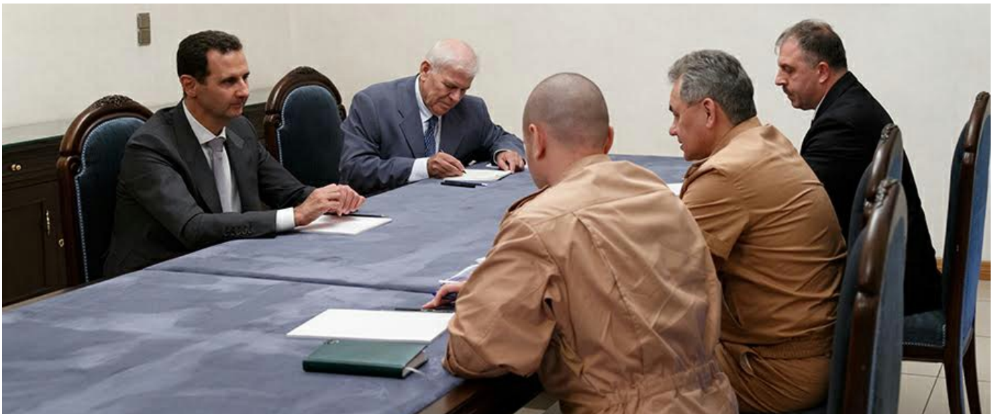
RUSSIAN DEFENSE MINISTER GEN. SERGEI SHOIGU MEETS PRESIDENT BASHAR AL-ASSAD.

The catalyst for both Jordan and Turkey’s reorientation on Syria was Russia’s September 2015 intervention, which fundamentally changed the strategic balance in Syria. 66 Turkey, for its part, had pushed for a “safe zone” in the eastern Aleppo countryside in summer 2015, only to be met with U.S. misgivings and foot-dragging. 67 Now Turkey has secured its Aleppo safe zone in the only way that remains feasible: working with and through Russia.