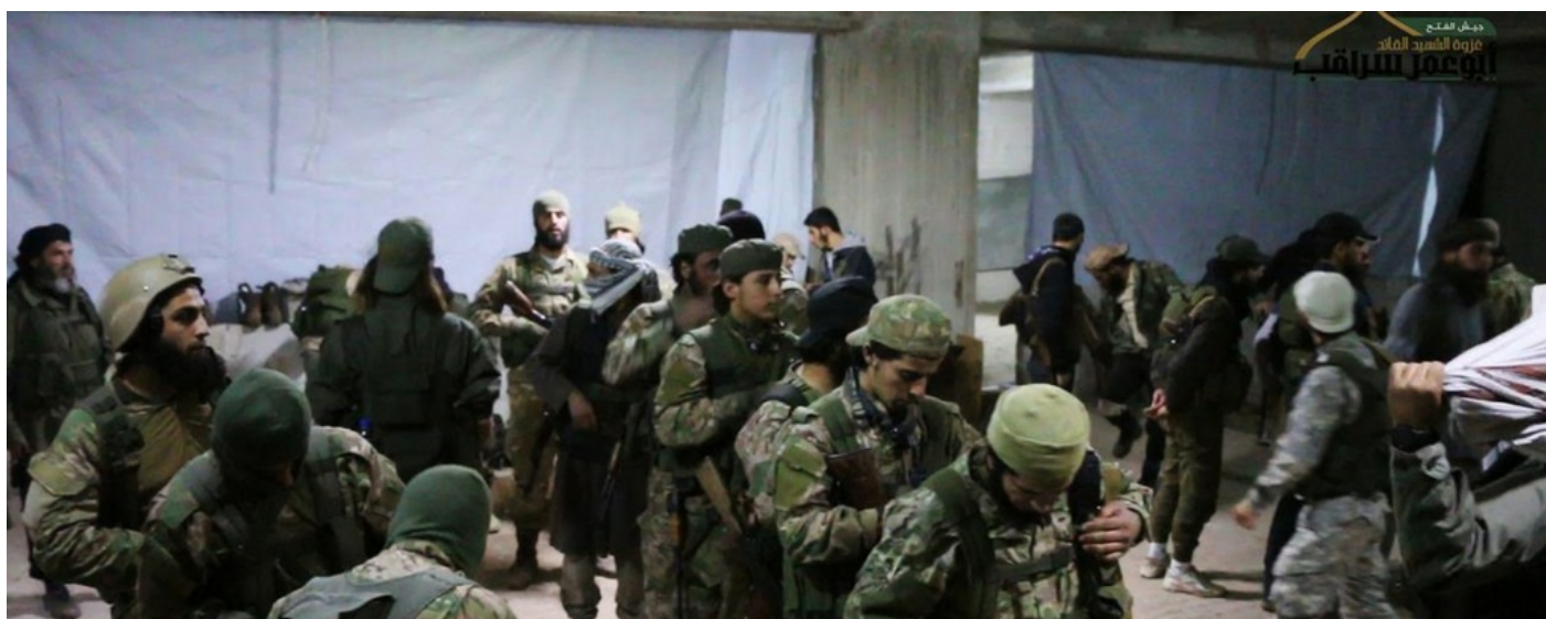
FATEH AL-SHAM FIGHTERS PREPARE TO STORM WEST ALEPPO.

Idlib is jointly dominated by the Fateh al-Sham Front—formerly Syrian al-Qaeda affiliate the Nusra Front 16 —and opposition faction and Islamist movement Ahrar al-Sham. Ahrar al-Sham has roots in internationalist Salafi-jihadism but has adopted a purely Syrian focus and aligned itself with the Syrian opposition mainstream. 17 The two compete for influence across the province, even as they coordinate militarily. 18 Together, they lead the Army of Conquest alliance, which captured Idlib's provincial capital and drove the regime out of its remaining strongholds in the province in early 2015.