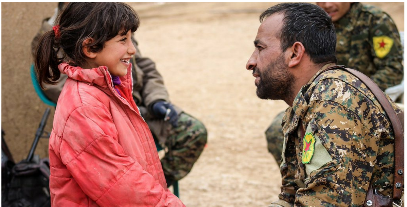
YPG COMMANDER SHAKES GIRL'S HAND IN AL-HSAKEH AREA CAPTURED FROM ISLAMIC STATE.

Islamic State seems to have persisted largely because of its enemies' political contradictions, 39 as well as its own success at liquidating any potential rivals inside its Sunni Arab constituency in areas of its control. It fairly thoroughly broke the east's rebel factions, absorbing some and massacring others. Those left were scattered across a dozen different factions and alliances up and down the country or run into permanent exile. There is no locally rooted and demographically representative—that is, eastern Sunni Arab—faction that can seriously challenge Islamic State in al-Raqqa province and Deir al-Zour.