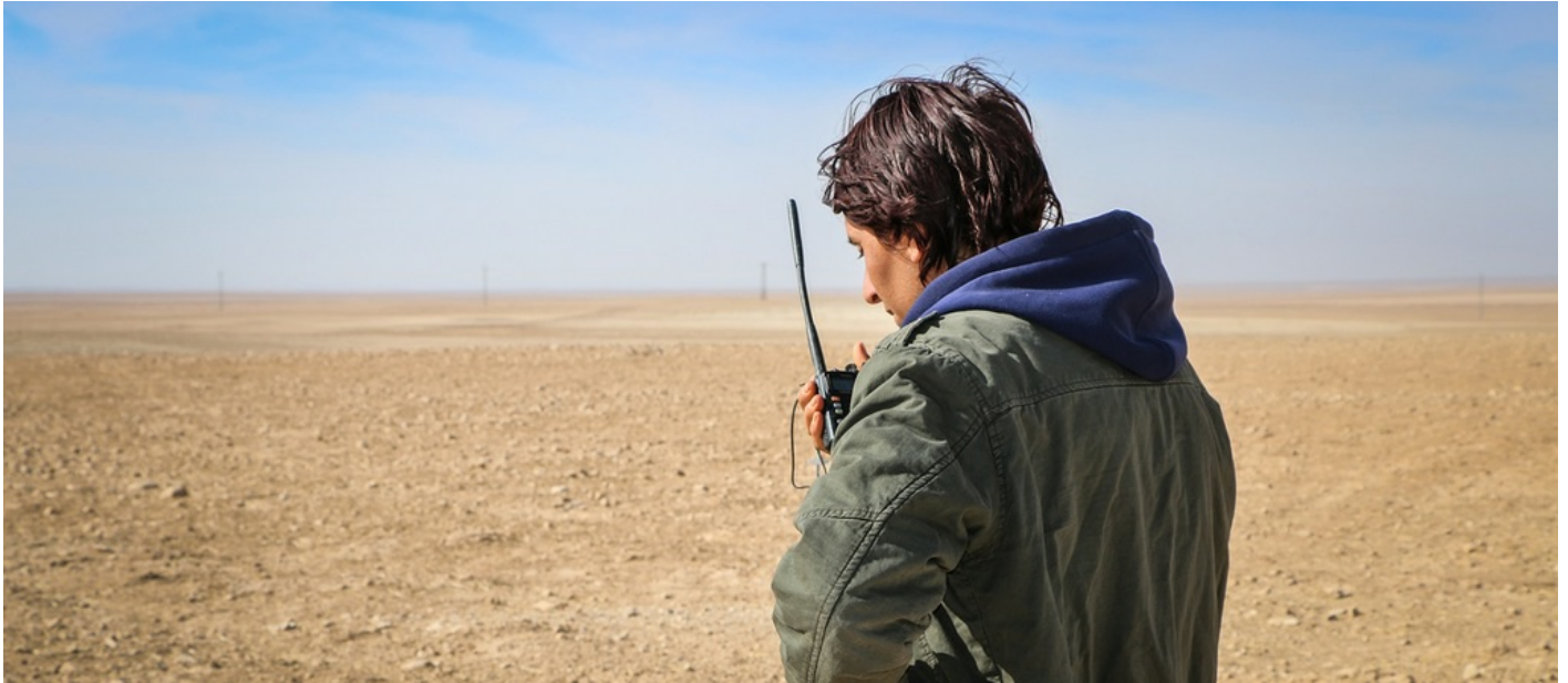
FEMALE SDF COMMANDER RADIOS HER COMRADES IN NORTH AL-RAQQA.

Kurdistan. Contiguous Rojava stretches along the Turkish border from the Euphrates River, Syria's midpoint, to the country's far northeast corner in Qamishli.