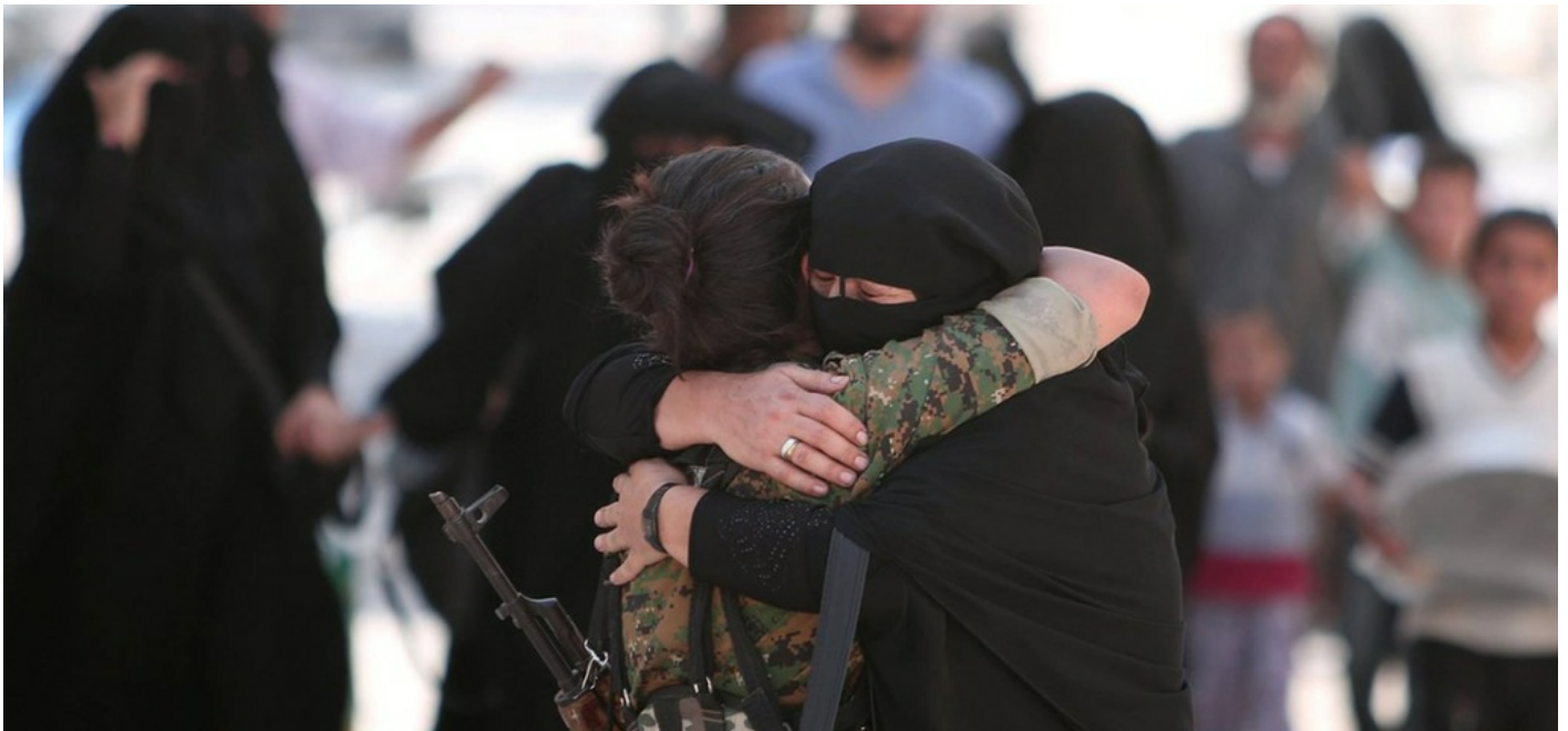
SDF FIGHTER EMBRACES LOCAL WOMAN AFTER CAPTURE OF MANBIJ.

Local politics do not currently permit the United States to achieve total, lasting victory against Islamic State. America should therefore calibrate its approach to the incremental gains that are currently available. At the same time, it can lay the groundwork for a more complete victory in the medium term. But for now, waging unlimited war for a limited, reversible victory would not be advisable.