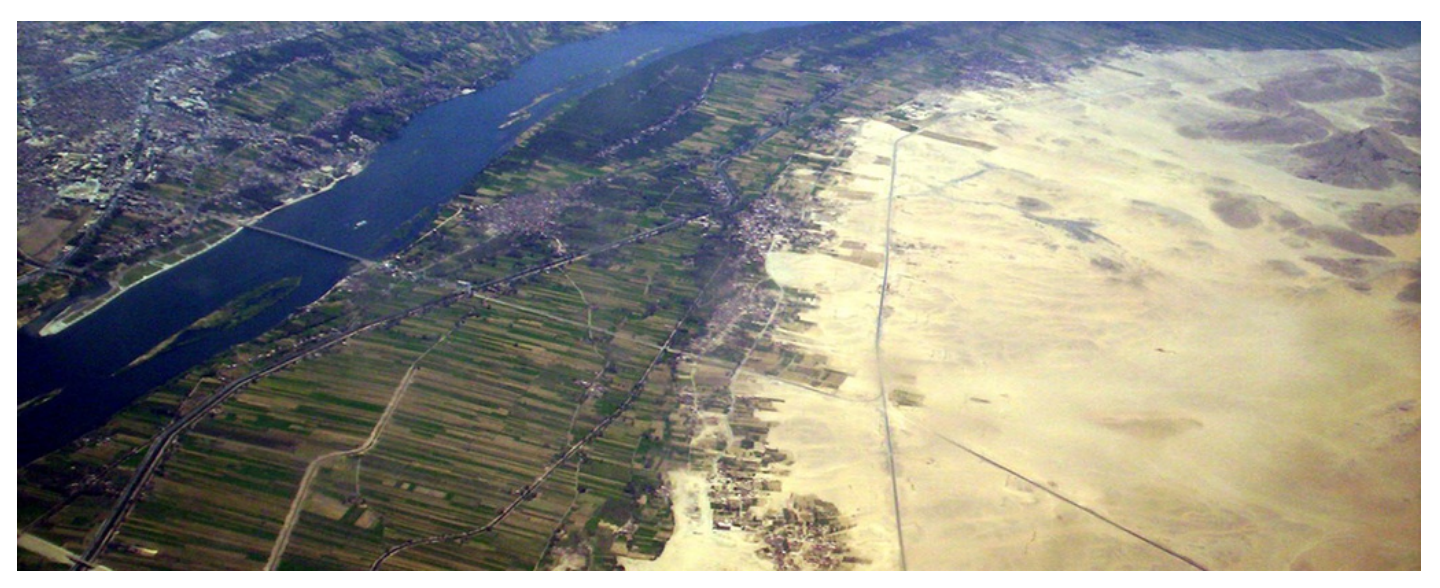
IRRIGATION CANALS HAVE OPENED DRY DESERT AREAS OF EGYPT TO AGRICULTURE.

Perhaps the greatest threat facing Egypt's water resources today are infrastructural developments in upstream riparian nations, such as Ethiopia. The Blue Nile, which begins in Ethiopia, contributes about 85 percent of the water flow that passes through Egypt to the Mediterranean. Egypt's annual Nile water share is around 60 billion cubic meters. Agriculture uses around 85 percent of that water.