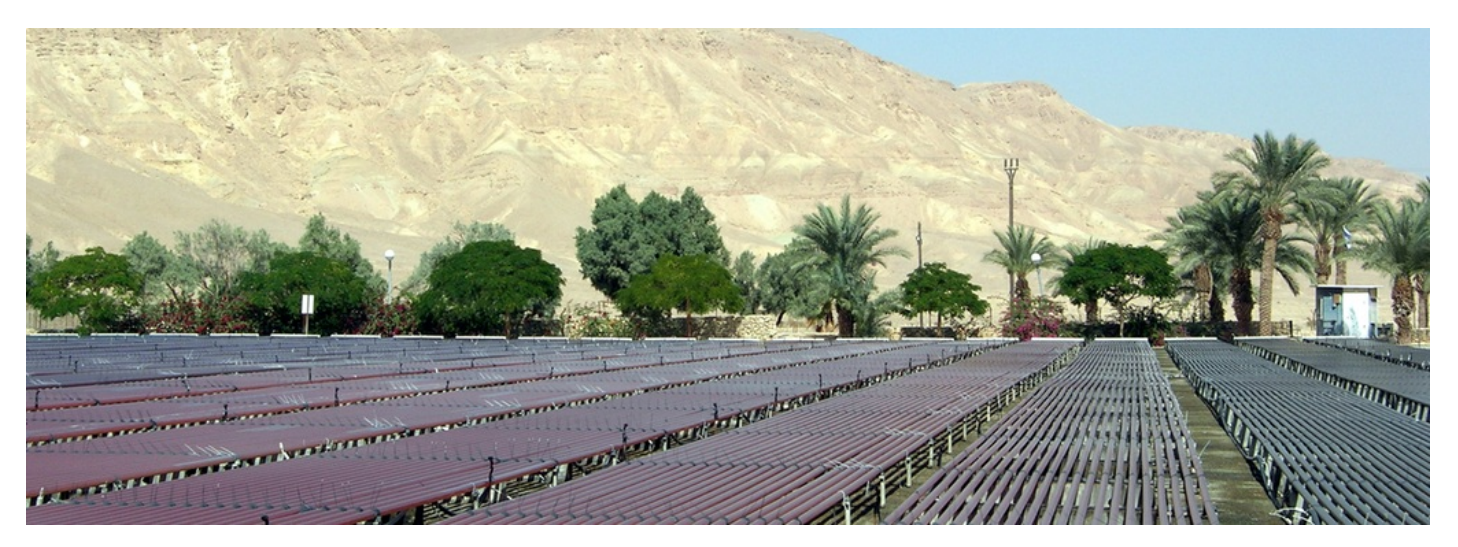
AQUACULTURE IN KIBBUTZ KETURA IN THE NEGEV DESERT, ISRAEL, SOURCEWIKIPEDIA.

Ironically, Egypt's neighbor Israel is a pioneer in developing water-efficient systems, surpassing every other competitor's ability to get "more crop per drop."<sup>30</sup> Israel is one of the only countries in the world that has created such an efficient infrastructure of water supply and conversion that it can now function without rain—the country recycles a big percentage of its own water, invented drip irrigation, and is the world leader in desalination.<sup>31</sup> More than 50 percent of the water for Israeli households, agriculture and industry is artificially produced.<sup>32</sup>Israel's knowledge in water resource management has been sought out by delegations from water scarce countries who visit Israel to become familiar with best practices and ways of adopting them back in their countries. Egyptian policymakers must engage in a similar constructive learning process with any knowledgeable entities that have the capacity to help Egypt to maximize its water efficiency, including Israel and despite the obvious domestic political sensitivities.