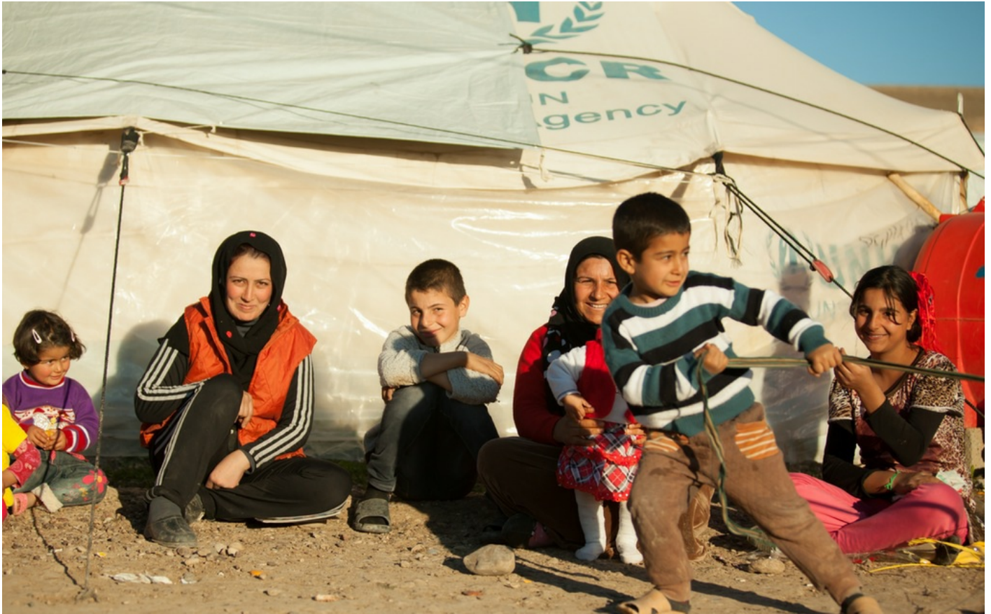
SYRIAN REFUGEE CAMP, KARKOSIK ERBIL.

The United Nations—which oversees most humanitarian aid inside Syria—has proven incapable of functioning impartially. 23 The Syrian government has been able to dictate which populations receive aid and which do not, all the while siphoning off a great deal of foreign humanitarian aid for its own supporters. The United Nations and its agencies operate under a state-to-state paradigm in an area where dozens of entities claim overlapping sovereignty.