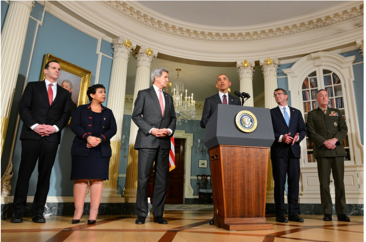
PRESIDENT BARACK OBAMA, AT LECTERN, DELIVERS REMARKS ON THE GLOBAL CAMPAIGN TO DEFEAT WITH THE ISLAMIC STATE OF IRAQ AND THE LEVANT AND OTHER ISSUES. FEB. 25, 2016.

Even in failure, increased intervention would mark a correction of American policy in the Middle East, which today suffers from a credibility gap, 1 driven by two mutually reinforcing mistakes: first, an over-eagerness to pull away from regional crises, even when those crises implicate core U.S. national security interests, and second, a major gap between rhetoric and practice. That disconnect was vividly displayed when President Obama disavowed his “red line” and backed off his threat to bomb Bashar al-Assad for using chemical weapons, and continues to characterize a White House that speaks constantly of disengagement while devoting the lion’s share of its foreign policy attention at the Middle East. 2