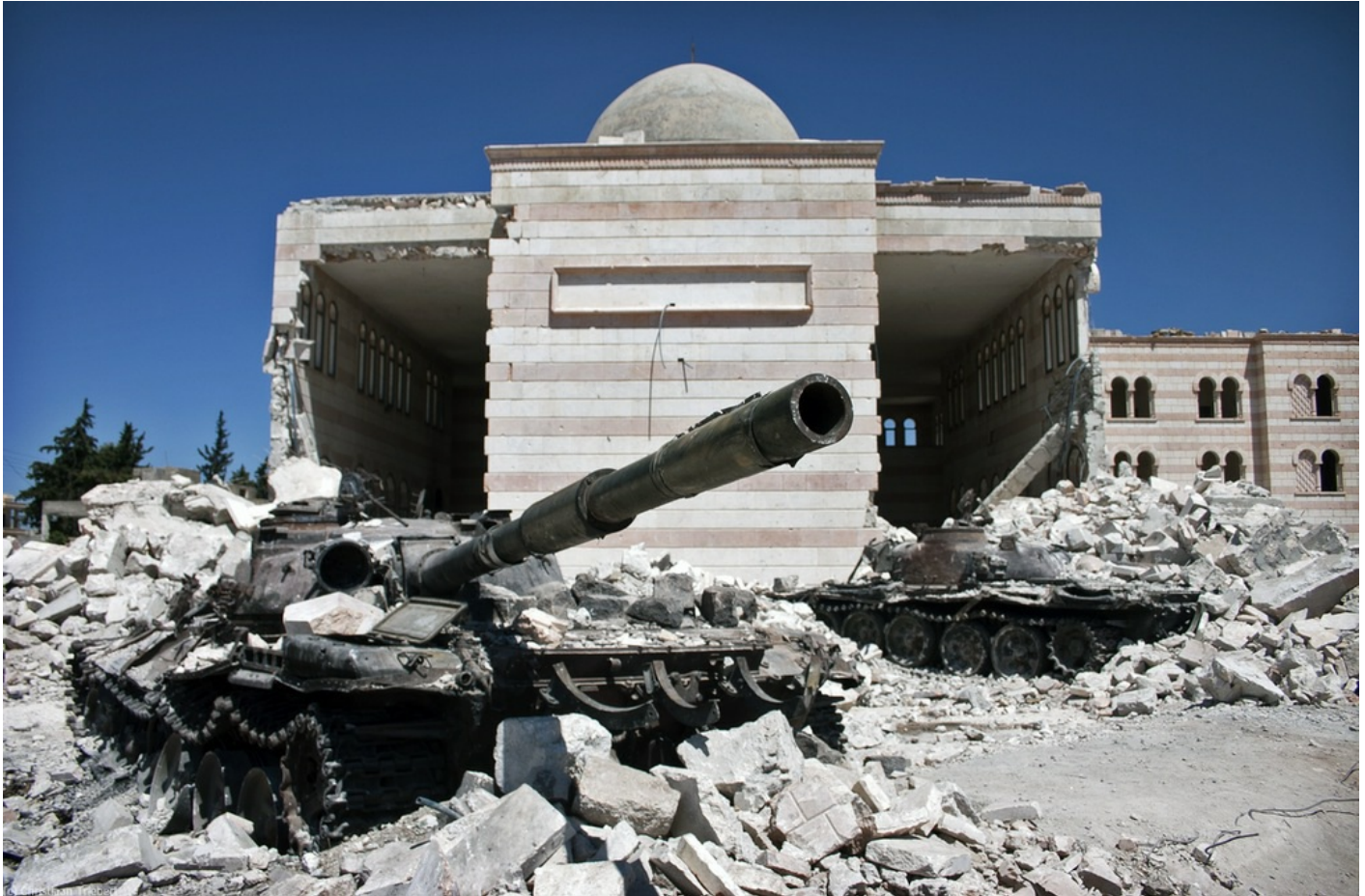
TWO DESTROYED TANKS IN FRONT OF A MOSQUE IN AZAZ, SYRIA. A BATTLE BETWEEN THE FREE SYRIAN ARMY (FSA) AND THE SYRIAN ARAB ARMY (SAA) WAS FOUGHT FOR CONTROL OVER THE CITY OF AZAZ, NORTH OF ALEPPO, DURING THE SYRIAN CIVIL WAR.

Army. Much of that U.S.-blessed support has flowed through so-called operations rooms in southern Turkey and in Jordan. 10 American allies have separately, and generously, funded other more Islamist fighting forces, including the Army of Islam around Damascus and Ahrar al-Sham, a group with both jihadist and nationalist pedigrees that is probably the single most powerful militant rebel force in northern Syria, outside of Al Qaeda's Nusra Front and the Islamic State group. Few of these groups—and none of the larger, militarily significant ones—can be described as “moderate.” (For that matter, nor can the Syrian government.)