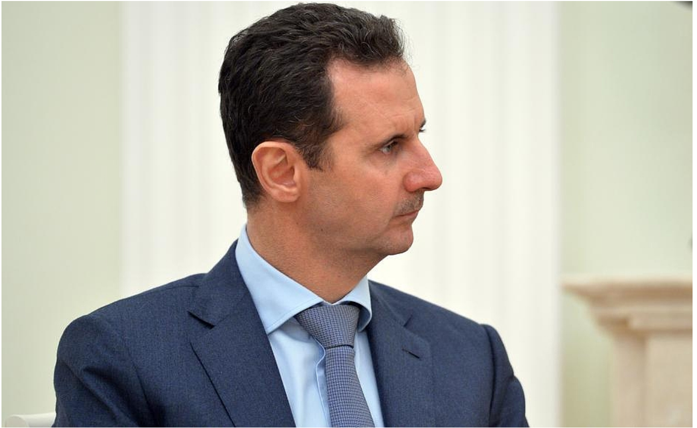
SYRIAN PRESIDENT BASHAR AL-ASSAD.

maximize that ongoing investment of resources.