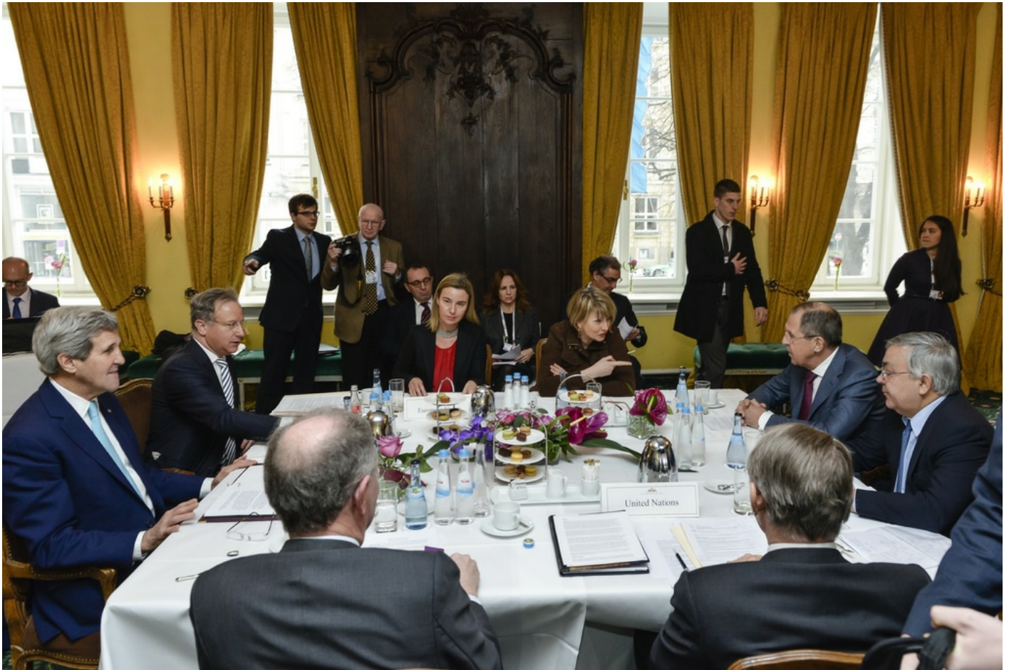
HIGH REPRESENTATIVE OF THE UNION FOR FOREIGN AFFAIRS AND SECURITY POLICY AND EUROPEAN COMMISSION VICE-PRESIDENT FEDERICA MOGHERINI (C) MEETING WITH SERGEI LAVROV (2R) MINISTER FOR FOREIGN AFFAIRS OF RUSSIA, JOHN KERRY (L) SECRETARY OF STATE OF THE UNITED STATES AND JAN ELIASSON (2R) DEPUTY SECRETARY GENERAL OF THE UNITED NATIONS DURING THE 51ST SECURITY CONFERENCE IN MUNICH, GERMANY ON FEBRUARY 8, 2015.

On the political front, the United States should continue and intensify its recent approach. Washington should maintain the open stance that Kerry has created with the Russians. It can open the tent to more deeply engage Iran, Saudi Arabia, and Turkey. Success requires a clear definition of the political aims: to reduce human suffering, increase stability in Syria and the region, and raise the slim chances of a negotiated settlement that preserves the integrity of the Syrian state. Only equilibrium allows for serious negotiation. If either side believes it can win outright, it will not entertain concessions.